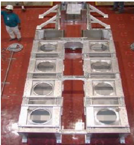
Fig. 4 - The Klystron Mounting Boxes on the Klystron/Modulator Support Stand.

Meanwhile, the controls backbone has been installed and checked out, and the high voltage power supply for the modulator has been installed. The advancement of all systems continues at full speed under an aggressive schedule.