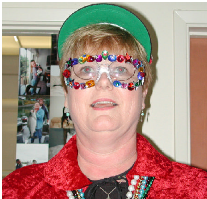
The 'Real' Robbin