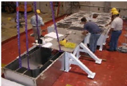
Fig. 1 - The Klystron/Modulator Support Stand, fabricated by LLNL, has been installed. The modulator oil tank in the foreground slides under the modulator support plate

If you have not been to End Station B recently you may not recognize the interior. The installation of the 8-Pack has been proceeding very rapidly and much of the infrastructure is in place. The massive support structure for the klystrons and modulator, which was designed and built by LLNL, is in place (Figure 1). The electronics racks have been mounted on their supports and connected to AC power (Figure 2). Cable trays are laid around the electronics racks (Figure 3), to the modulator/klystron stand, and up the NLCTA wall, and plumbing is being installed to provide cooling for the klystrons. The installation of the infrastructure is on schedule with the raised floor due to be put in place at the end of June, the phase 1 modulator due to be installed July 12 th , and with the modulator ready to power klystrons at the end of August.