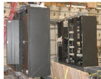
Fig. 2 - Electronics Racks in Place on Their Supports

For the DLDS system in phase 2 of the 8-pack project, it will be necessary for a successful PPM klystron to be developed. This puts great importance on solving the problems seen in the present tubes. It is anticipated that PPM klystrons will be available before they are needed, and these klystrons will be incorporated into the 8-pack system as soon as they are ready.