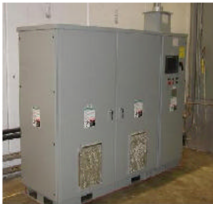
Fig. 5 - The High Voltage Power Supply for the Modulator is Installed