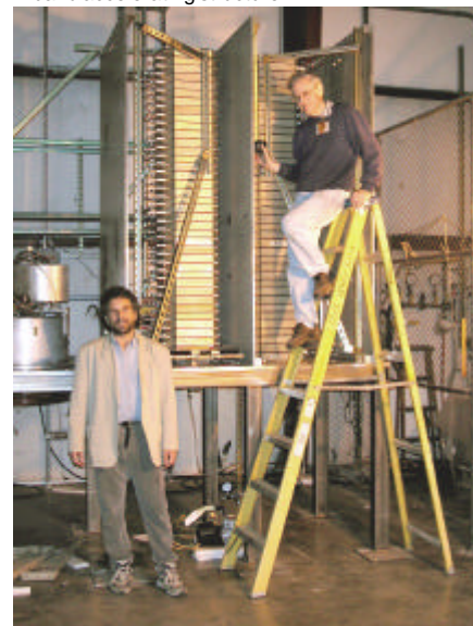
Figure 2. The 'Four-Dog' 76-stage modulator prototype, nearing completion.