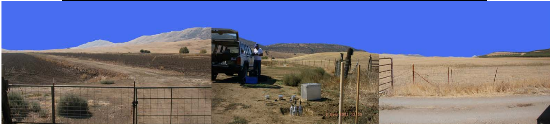
① View Looking South